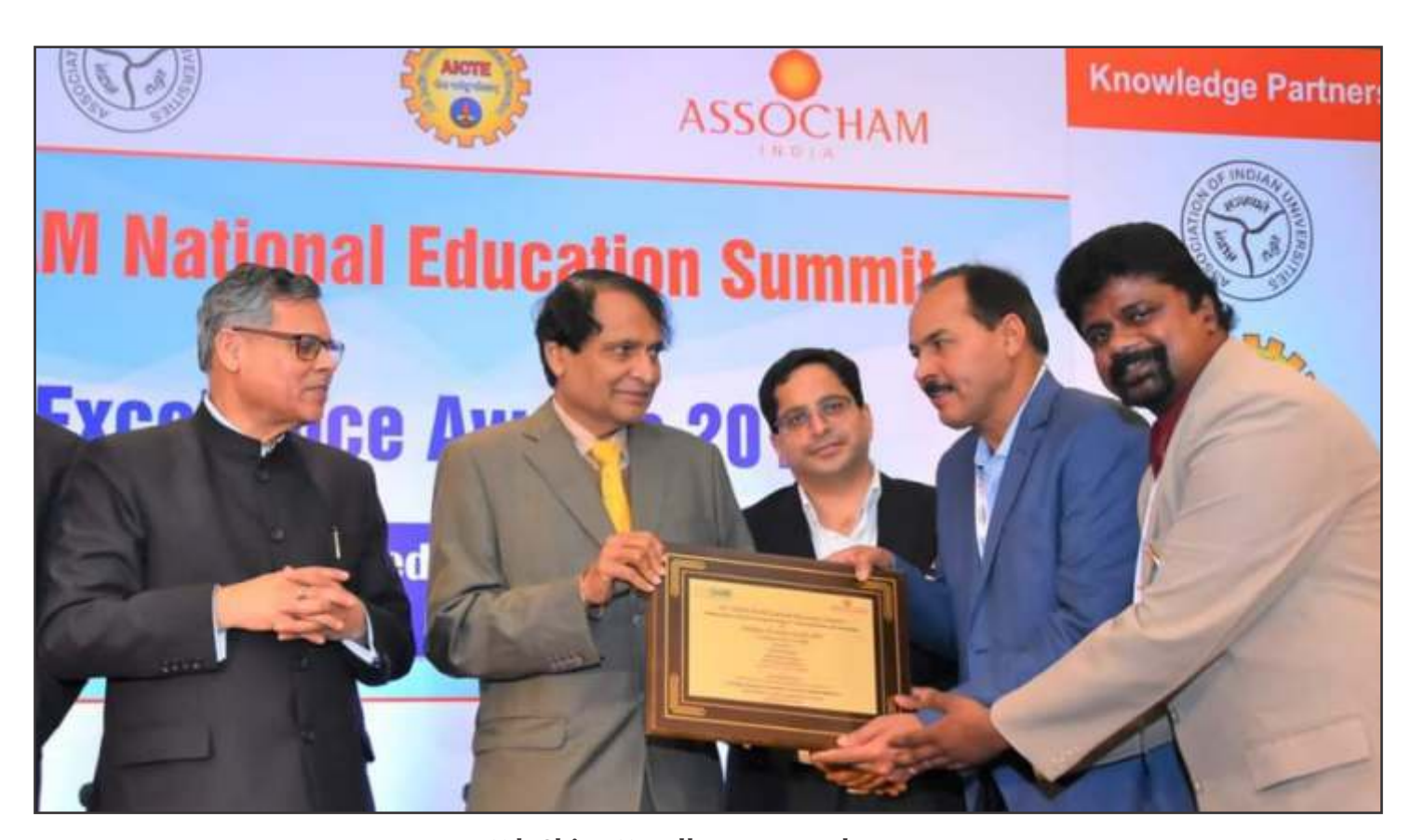
EduShine Excellence Award 2019

based on the Shodhganga project to recognize INFLIBNET Centre as "Emerging Institute Promoting Government Digital Initiatives" during 12<sup>th</sup> ASSOCHAM National Education Summit under the theme "Making India a global Knowledge Powerhouse: Catalyzing Reforms and Innovation".