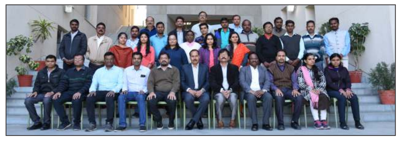
Participants of 146<sup>th</sup> Training Programme on SOUL 2.0 with the Director and Technical Staff of the INFLIBNET Centre