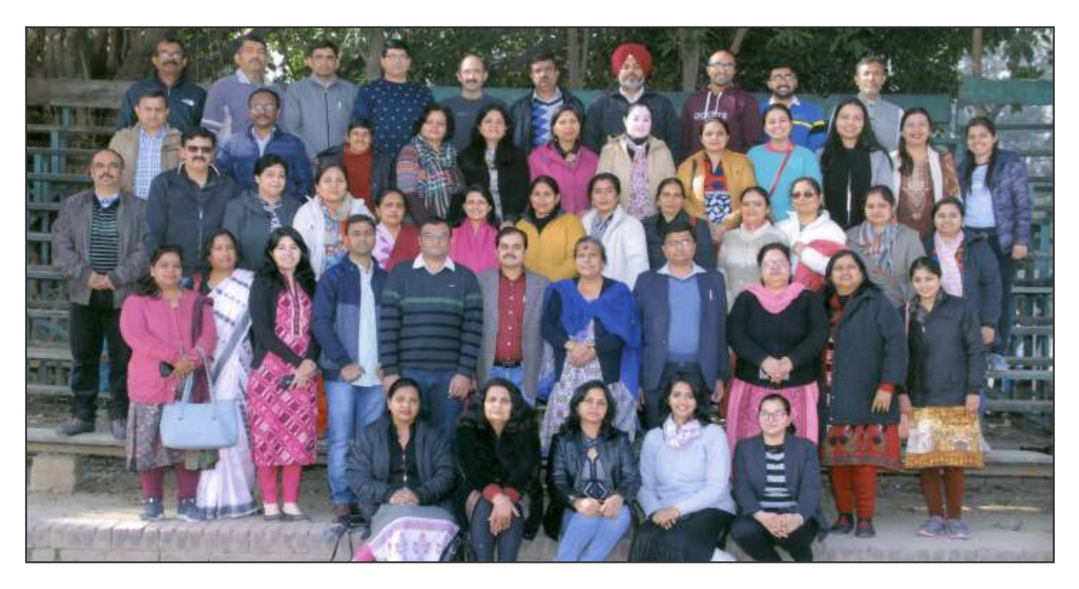
Participants of National Workshop on Creation and Management of Digital Libraries Using Open Source Software at Panjab University, Chandigarh

Five-day National Workshop on Creation and Management of Digital Libraries Using Open Source Software, Panjab University, Chandigarh, 07<sup>th</sup> - 11<sup>th</sup> January